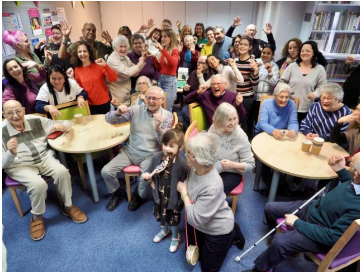
Star factor: Rose Ayling-Ellis surprised staff and members of Finchley's Jewish Deaf Association