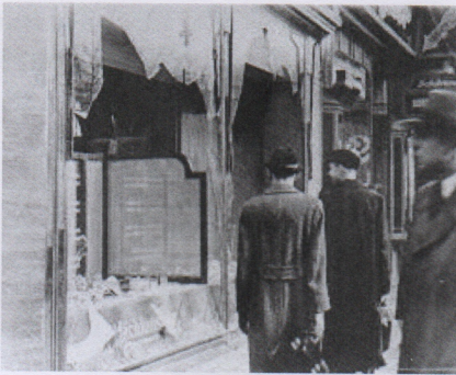
Walking past a damaged shop

Jewish homes, hospitals and schools were ransacked as the attackers demolished buildings with sledgehammers. The rioters destroyed 267 synagogues throughout Germany, Austria and the Sudetenland. Over 7,000 Jewish businesses were damaged or destroyed, and 30,000 Jewish men were arrested and incarcerated in concentration camps. Nearly 100 Jews were murdered that night, and the Nazi Party ordered the police and fire service not to interfere (except where Nazi-owned buildings were threatened by any fires).