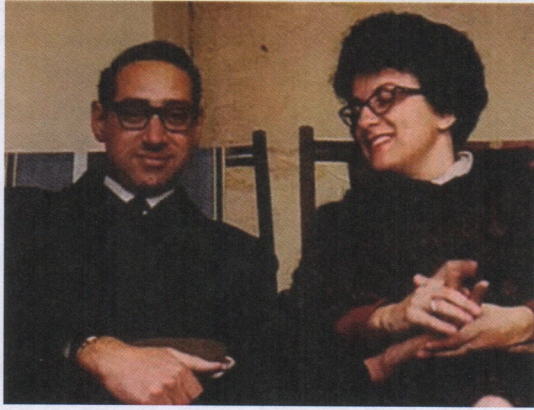
On their honeymoon