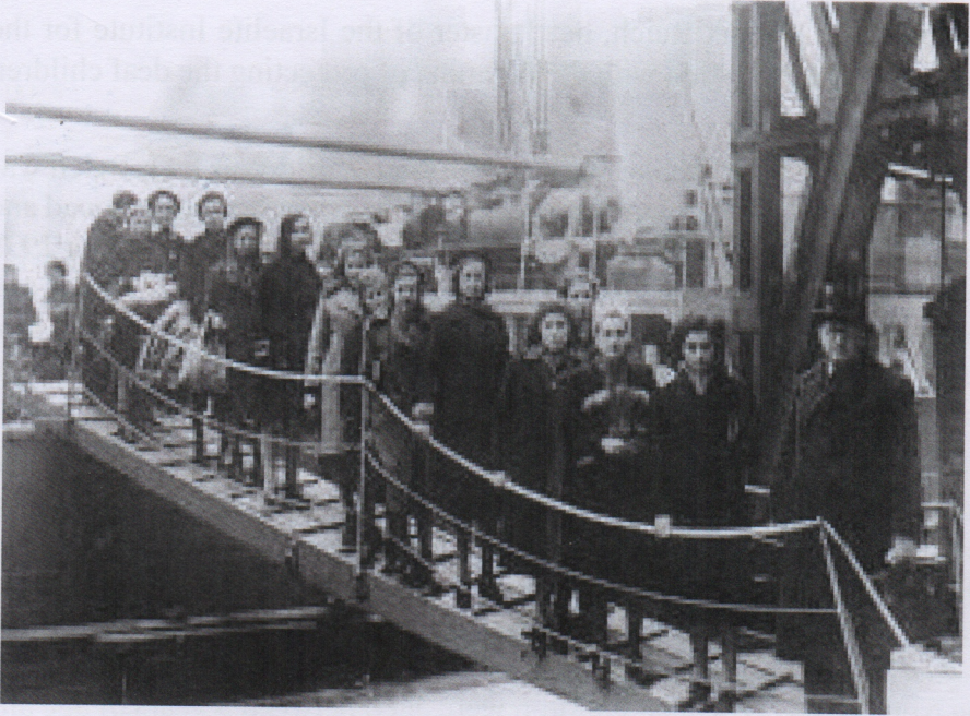
Arriving at Harwich

In Germany, priority lists were made of those most in peril: teenagers who were in concentration camps or in danger of arrest, Polish children or teenagers threatened with deportation, children in Jewish orphanages, children whose parents were too impoverished to keep them, or children with a parent in a concentration camp. Once the children were identified or grouped by list, their guardians or parents were issued a travel date and departure details.