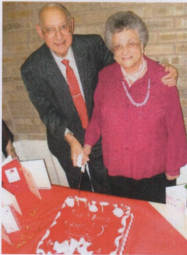
Celebrating their Ruby wedding anniversary on 12 th November 2007