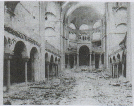
A badly damaged synagogue

Kristallnacht was a wake-up call for Europe's Jews, particularly in Germany and Austria, a taste of what was to come in later years and on 15 November, a delegation of British, Jewish, and Quaker leaders appealed, in person, to the Prime Minister of the United Kingdom, Neville Chamberlain. Among other measures, they requested that the British government permit the temporary admission of unaccompanied Jewish children, without their parents.