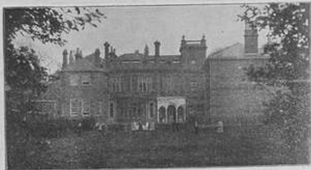
THE DEAF AND DUMB HOME, FROM THE LAWN.