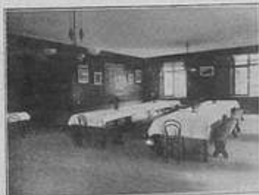
THE DINING HALL.