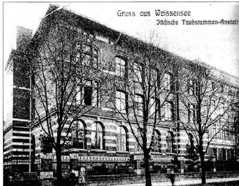
Jewish School for Deaf and Dumb in Berlin