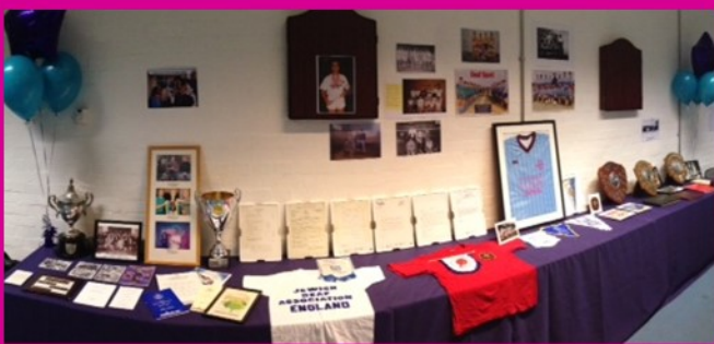
▲ Exhibition of memorabilia - celebrating JDA's rich sporting history in photographs, trophies, clothing