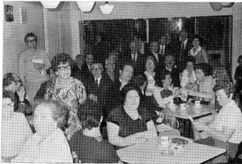
Enjoying a cup of tea and a chat in the Canteen