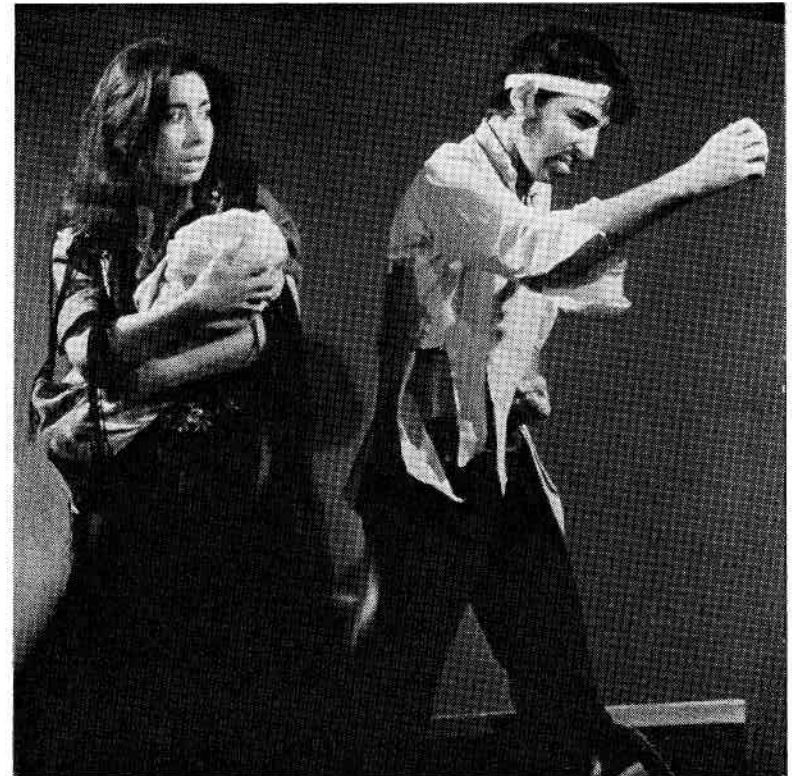
Members of our Dramatic Section