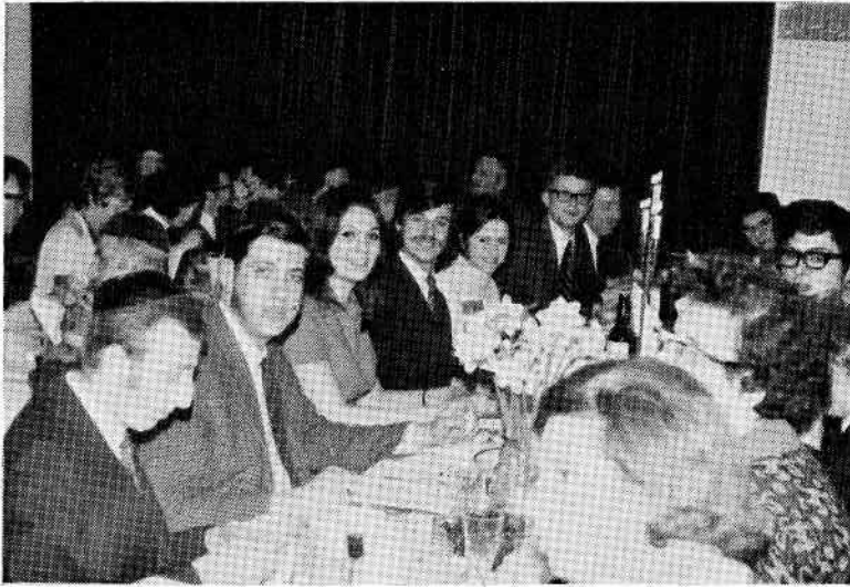
Young deaf people at the Seder table