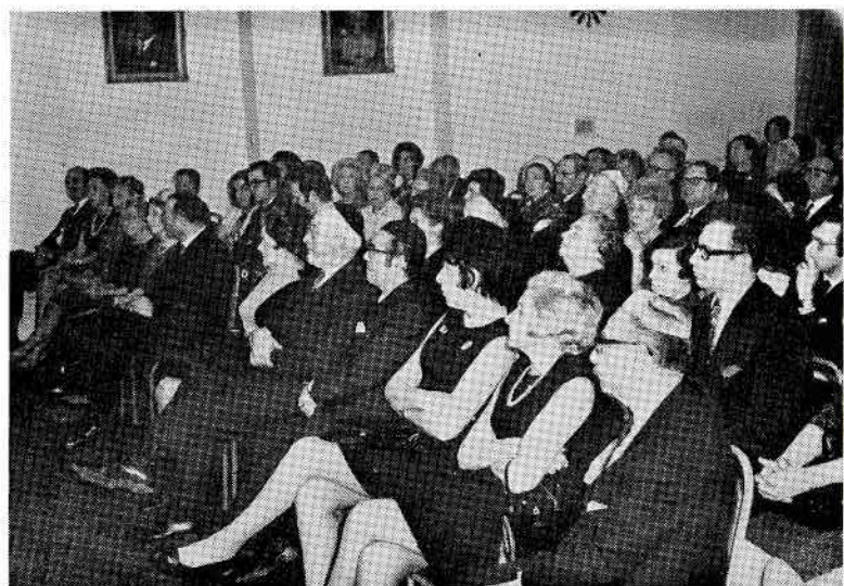
The attentive audience