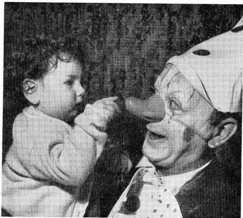
Scene at Children's Party given by Deaf Members.