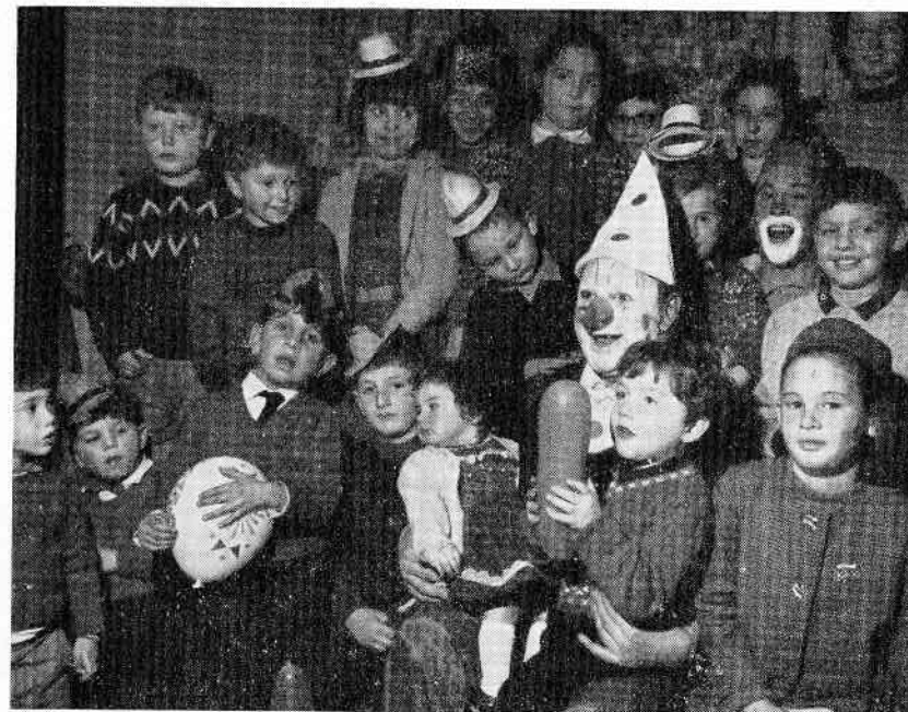
Part of the audience at the Deaf Children's Party.