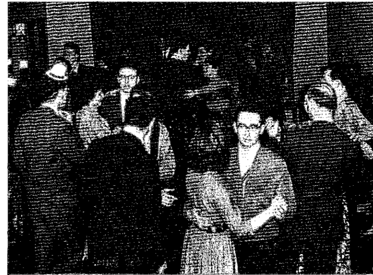
★ A Dance at the Club. One of the regular monthly activities enjoyed by members and at which many are surprisingly adept.