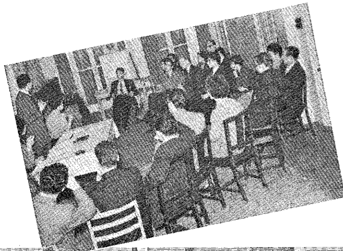
A Member makes his point, while others of the Discussion Group ponder attentively.