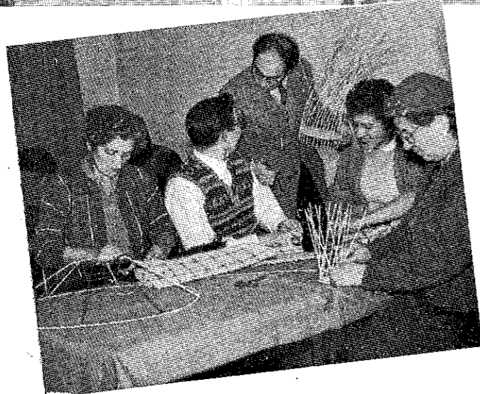
The Handicrafts Section at work.