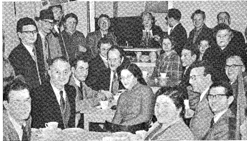
The Chanukah celebrations in the Louis Lesser Canteen.