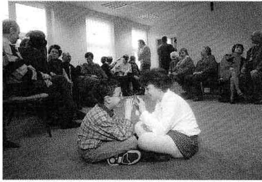
Signing will play a big part of Koleinu's educational programme for children.

March 1st...the builders are still in, but more than a hundred members accepted our invitation to come in to the new Centre for a preview.