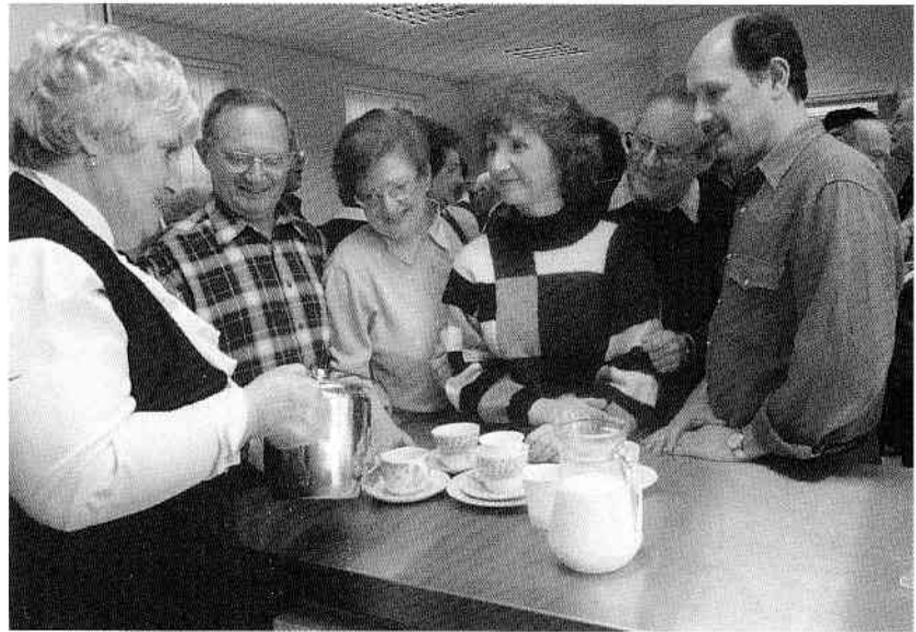
The ever-popular catering facilities! Members took advantage of the fully fitted, kosher kitchens to warm themselves with a hot cup of tea and a selection of cakes and biscuits.