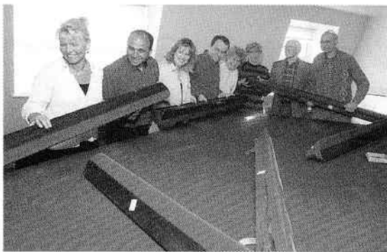
The full size snooker table had to be re-assembled after its journey from Cazenove Road, before members could enjoy it in its new home. The floor in the new Centre has been specially reinforced to take the weight of the table.