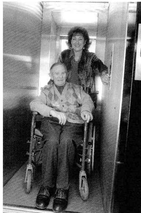
The new Centre has excellent facilities for the disabled, including a lift which will accommodate wheelchair users.