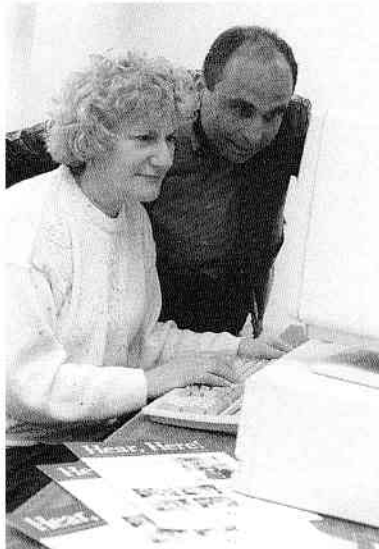
The new Centre will have facilities for computer training. In keeping with the JDA policy to involve the users, the tutors will themselves be hearing impaired, so breaking down any communications barriers.

The plan now is to have the Day Centre open by late April/early May, and have everything operational by September, including the signing, lip-reading and IT classes.