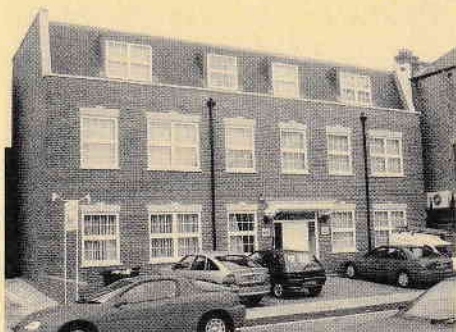
The New JDA Centre