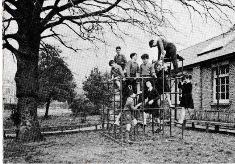
High Spirits in the Garden