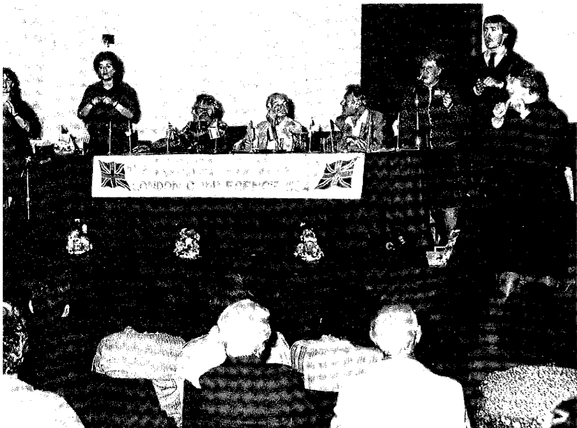
The Jewish Deaf Association sponsored the first World Conference of Jewish Deaf to be held in London. The picture shows Sign language interpreters from Israel, the United Kingdom and the United States of America in the different languages to a mainly deaf audience.