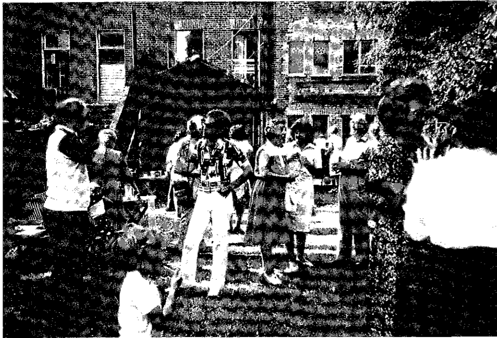
"Signing" and "Saying" at the JDA Garden Party