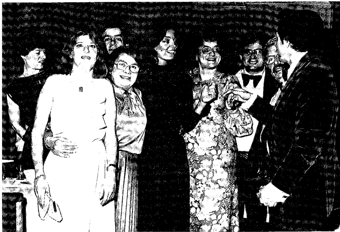
Deaf actress Elizabeth Quinn, star of "Children of a Lesser God" with deaf members of the Jewish Deaf Association.