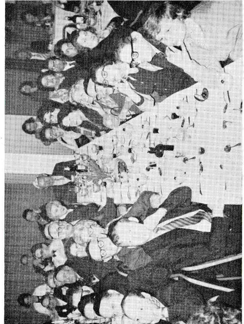
Spellbound attention to the Annual Seder Service

We thank the Ladies' Guilds, especially those who ran functions on our behalf; The London Boroughs who have helped us whenever approached; The Business Managers who so readily donated goods for our Bazaar; The B'nai B'rith Lodges; the Welfare Committee of the United Synagogue and all the individual donors, covenanters and subscribers, without whose help we could not exist.