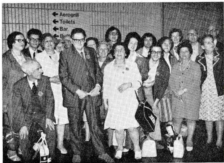
Departure for Israel