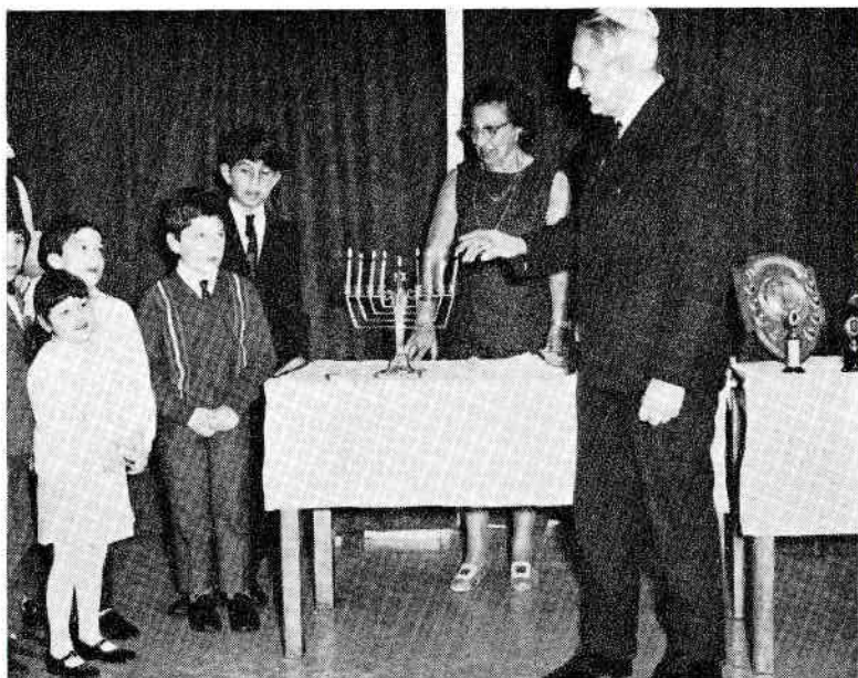
Chanukah for Children of Deaf Members