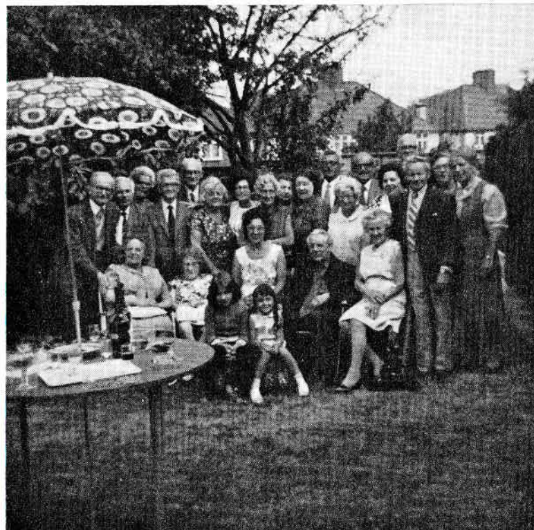
Our Friendship Club invited to Tea

All this helps to bring some pleasure into the lives of these people, who are not only suffering from the loneliness that old age brings but also from the extra burden caused by their deafness.